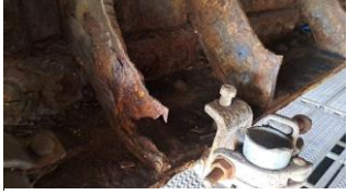
Corrosion on the Bridge

The Heritage Group have requested a further visit to Corporation Bridge in light of the fact that the it has now been announced that works on the Bridge are now delayed for an indefinite period. North East Lincolnshire Council have reported that the delay is due to corrosion, which was more severe than expected, being revealed following the initial shot blasting. There is now some concern that the available funding will not be sufficient to complete the repairs.